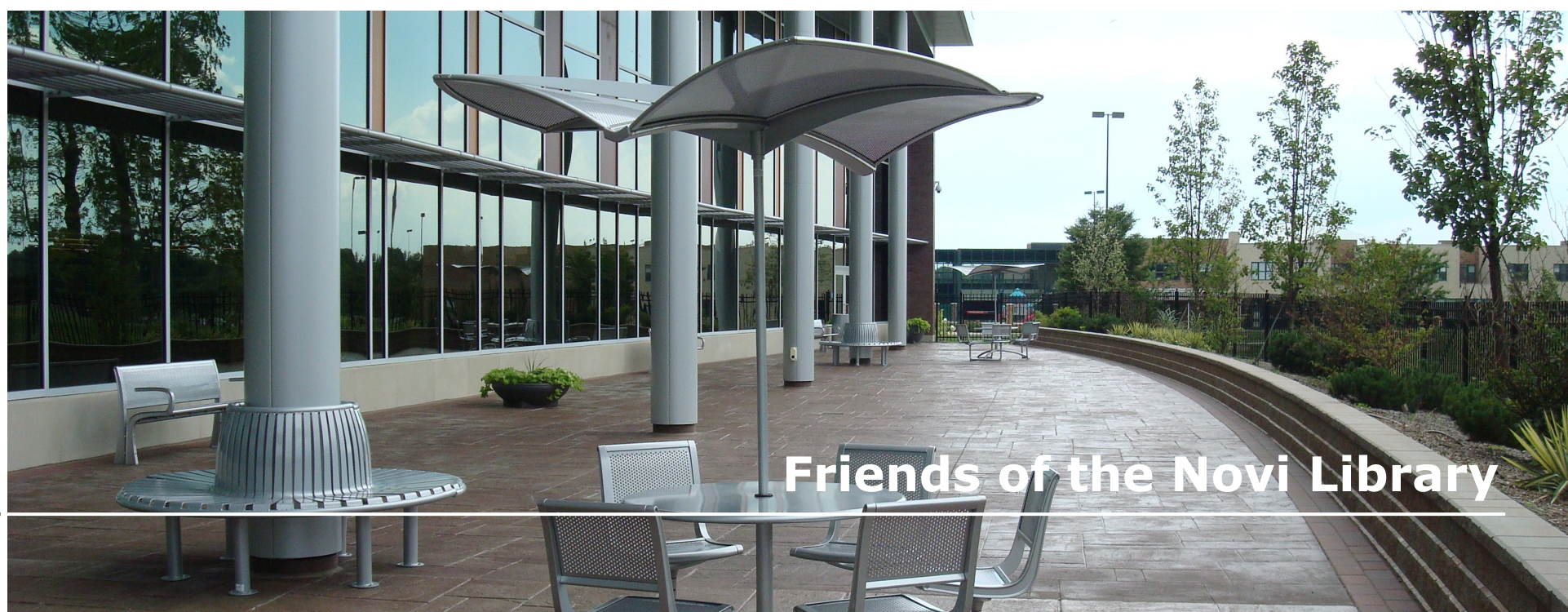
Friends of the Novi Library